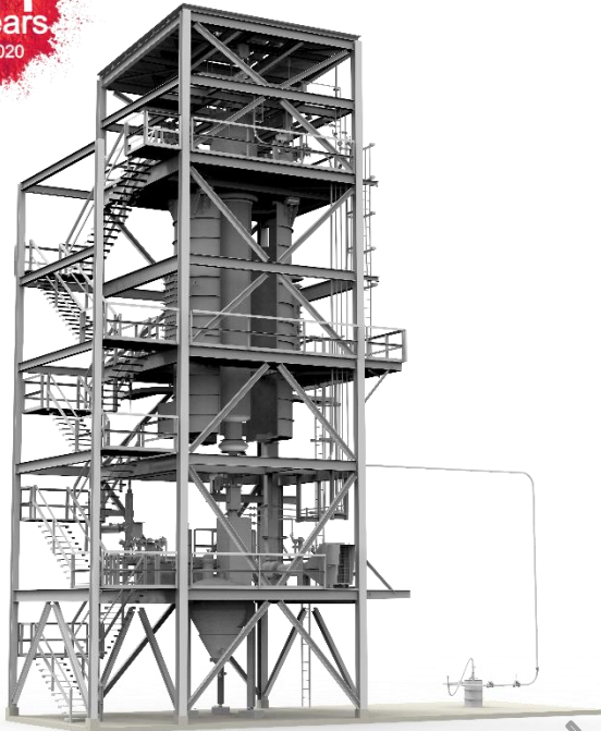
High Temperature Fluidized Bed